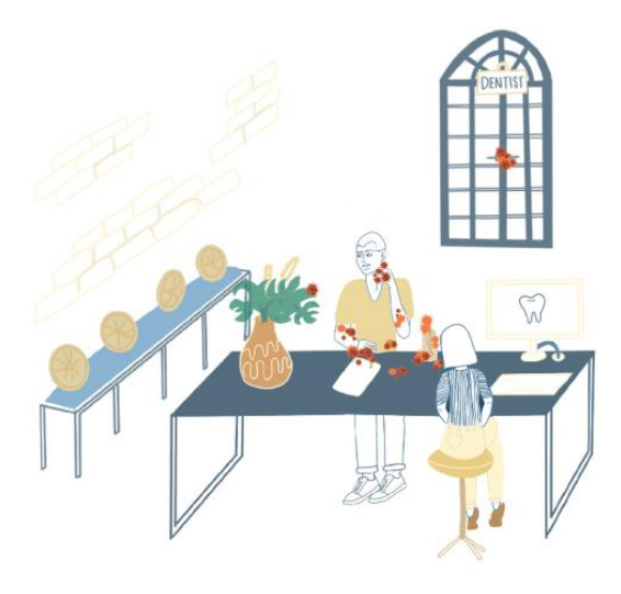
Contaminated hands spread disease.